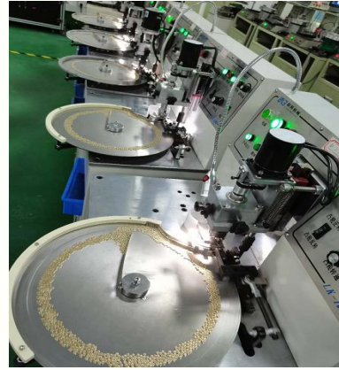
Fully Automatic Sealing Line