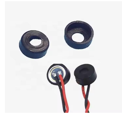
Wiring Harness Terminal +Sleeve