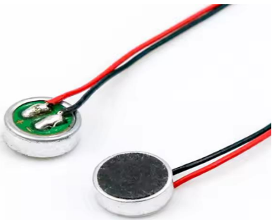
Wire soldering type