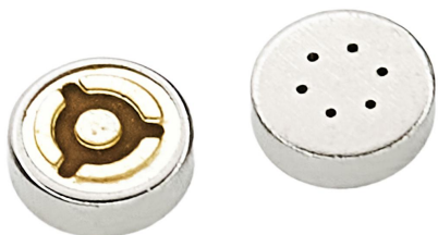
Omni-Directional SMD 4013-CR