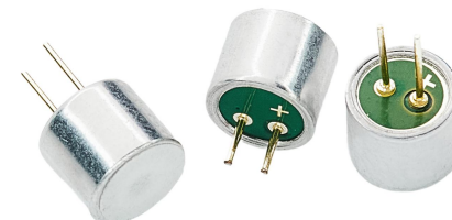
Omni-Directional Pin 6050P5-C