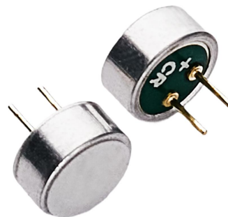
Omni-Directional Pin 6030P2.8-CR