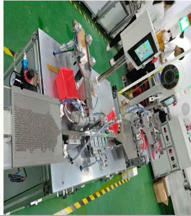
Fully Automatic Assembly Line