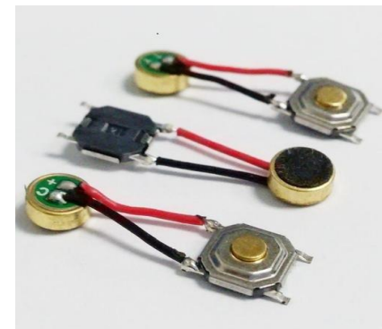
4.0*4.0*1.7 Switch assembly